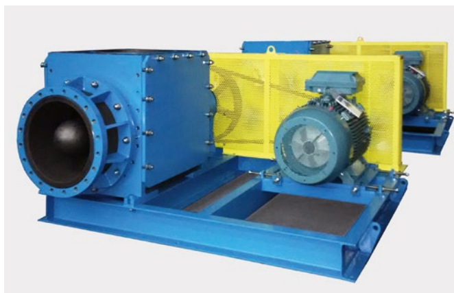
↑ DIABON C500 motor-pump groups