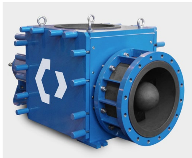
↑ DIABON/DURABON C400 bare-shaft pump